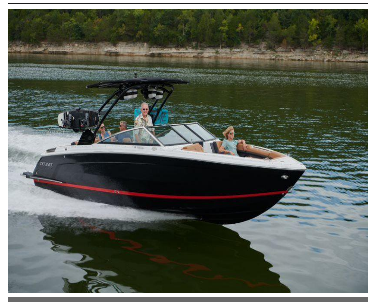
2024 Cobalt R8