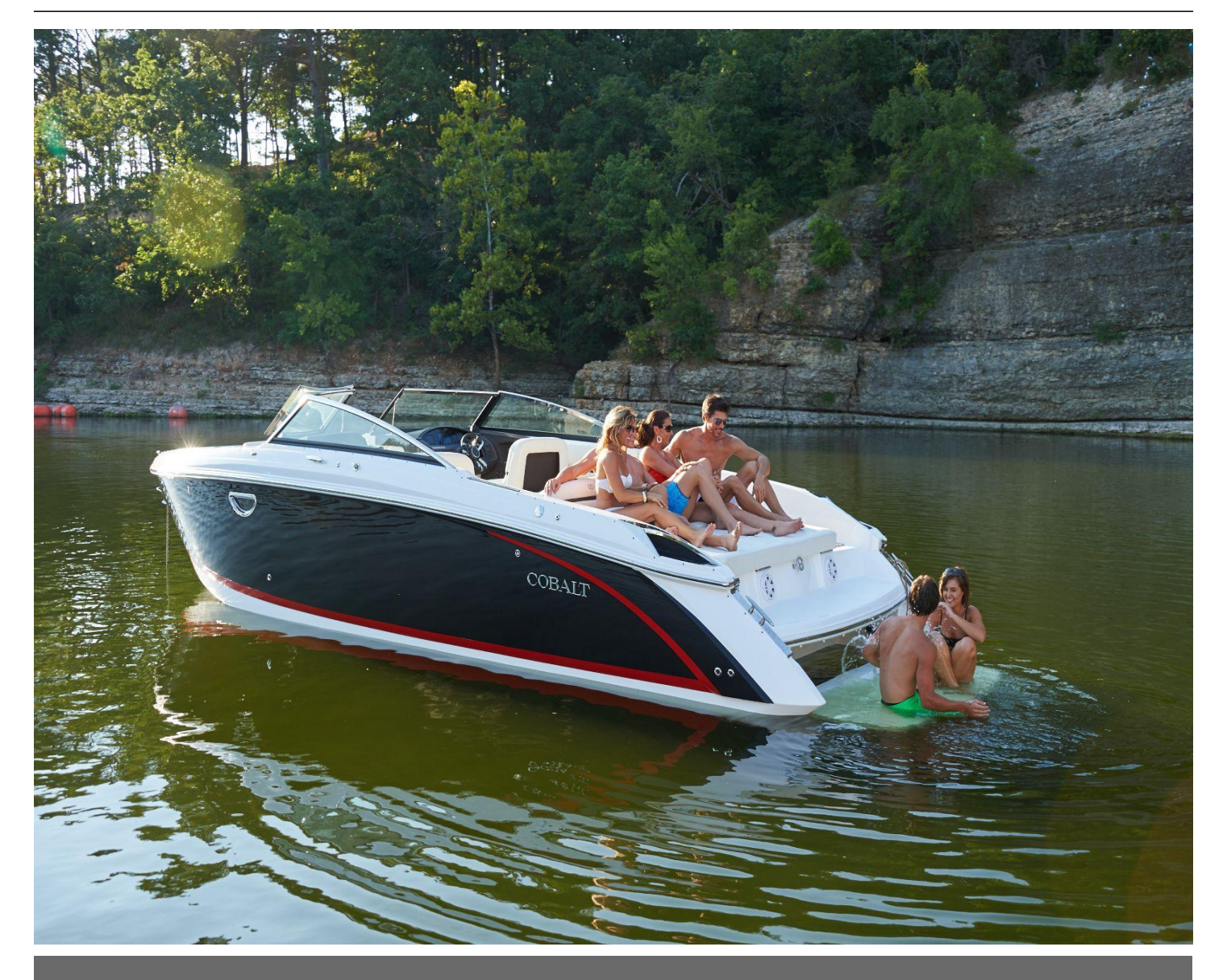
2024 Cobalt R30 $514,209