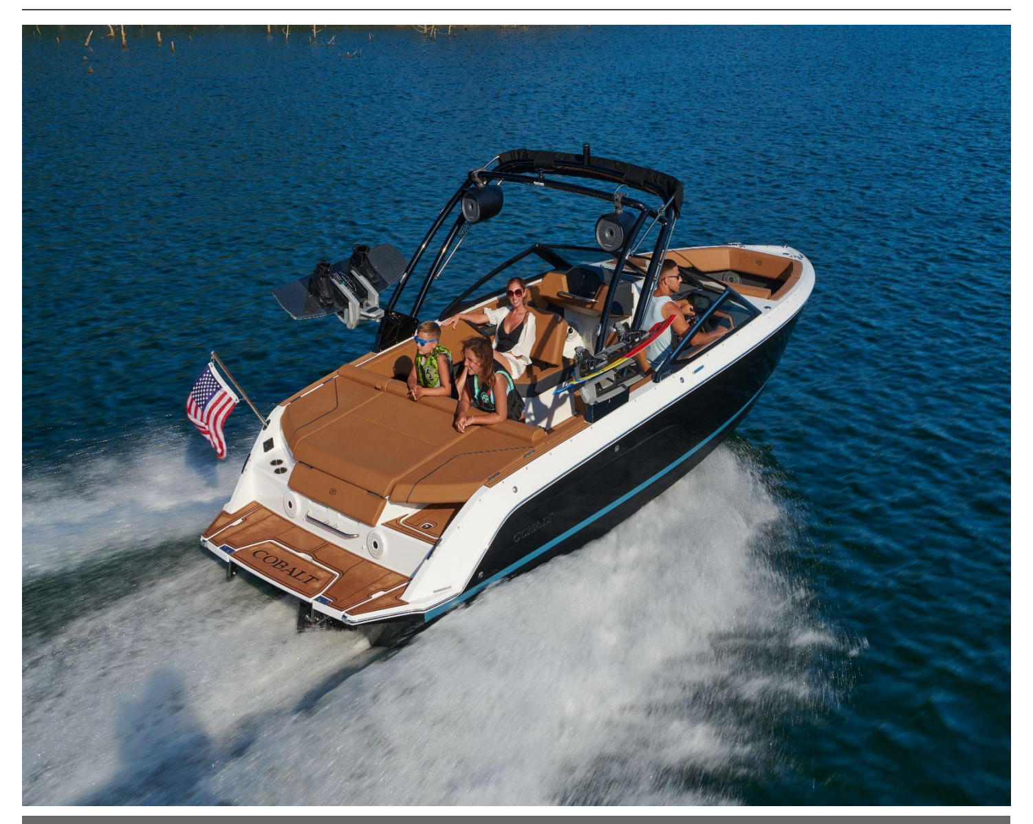
2024 Cobalt CS23 $191,161